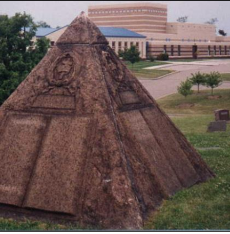
Satanic (all-seeing eye of Horus) memorial placed near Russell's grave site at the Rosemont United Cemetery in Philadelphia, PA.