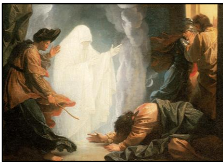
Depiction of the Witch at Endor Conjuring Samuel