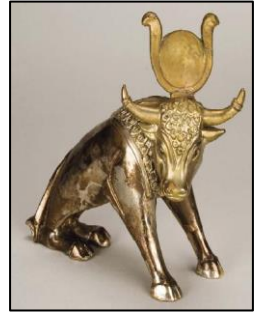
"Molten Calf" Exodus (32:1-6)